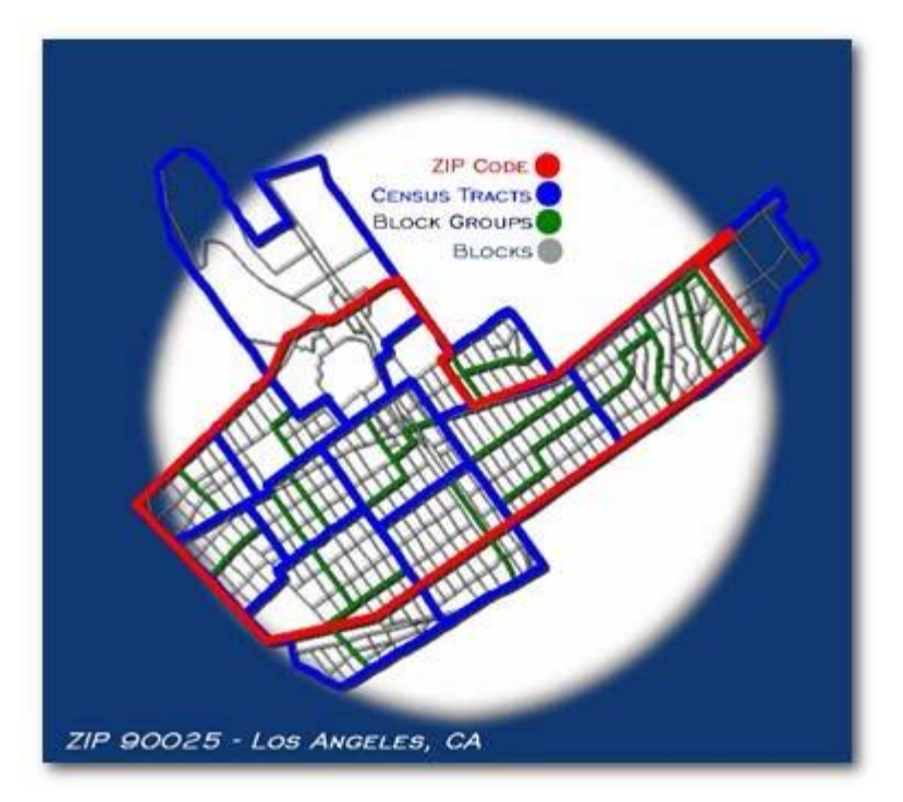
Relative size of zip codes and standard census geographies.

The following graphic shows the relationship between zip codes and census geographies.