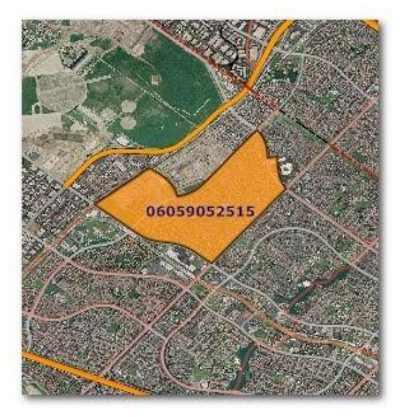
A Typical Census Tract in an Urban Area

Census Tracts: Each county is subdivided into census tracts. Census tracts usually contain between 1,500 and 8,000 people with a target size of 4,000. Census tracts are set at each decennial census. Many never change because they exist in established population areas. On urban edges and country areas, census tracts can be quite large since they are drawn in such a way as to come as close as possible to the targeted population threshold. This can create problems in period between a decennial census if new residential development occurs. While the problem will be corrected at the next census when a census tract is subdivided to reflect the new population reality, spatial queries in the interim period can fail to accurately capture the real profile of a particular census tract. The following illustration demonstrates the problem