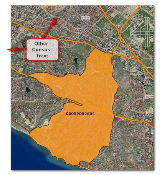
Census Tract In Undeveloped Area at Last Census—Now Being Developed

Block Groups: Census Block groups are standard Census Bureau geographies. Typically 4 to 6 block groups aggregate to form a census tract. A block group is the lowest level of geography for which census data is released—for privacy purposes. Block groups generally contain between 600 and 3,000 people with a targeted optimum size of 1,500. Block groups never cross the boundaries of states, counties, or statistically equivalent entities, except for a block group delineated by American Indian tribal authorities. They never cross the boundaries of a census tract. The Block Group is the lowest level that the Census Bureau tabulates sample (long form, for example) data.